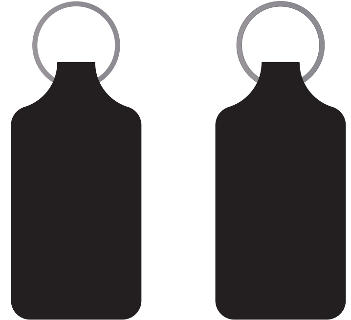
Level 2 at 60%